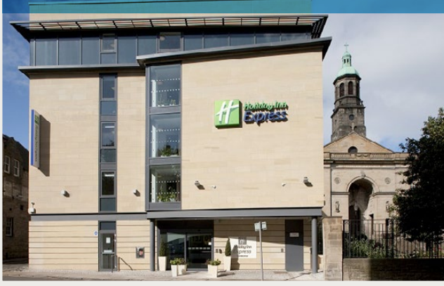
HOLIDAY INN EXPRESS ROYAL MILE EDINBURGH

This prominent Edinburgh hotel, located close to the world famous Royal Mile was sold on behalf of CHGF. The 78 bedroom hotel is ideally position to cater for Edinburgh's year round diverse tourist base. There was strong demand for this hotel business.