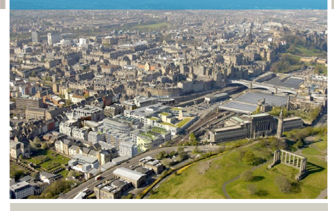
CALTONGATE REDEVELOPMENT EDINBURGH

Operator selection secured with Whitbread for a Premier Inn and Hub by Premier Inn, first of its kind outside London.