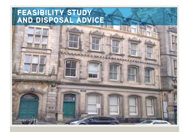
INDIA BUILDINGS EDINBURGH

Financial feasibility study, best use scenario analysis and exit sale for the India Buildings property in central Edinburgh.