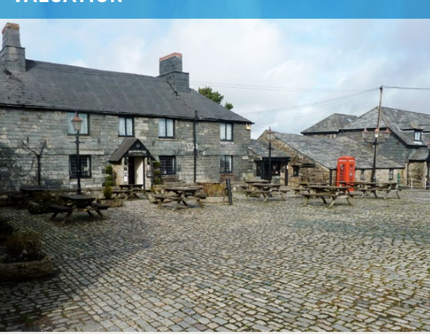
JAMAICA INN BODMIN MOOR

This internationally known inn has 16 bedrooms with a shop and museum, valued for a potential purchaser.