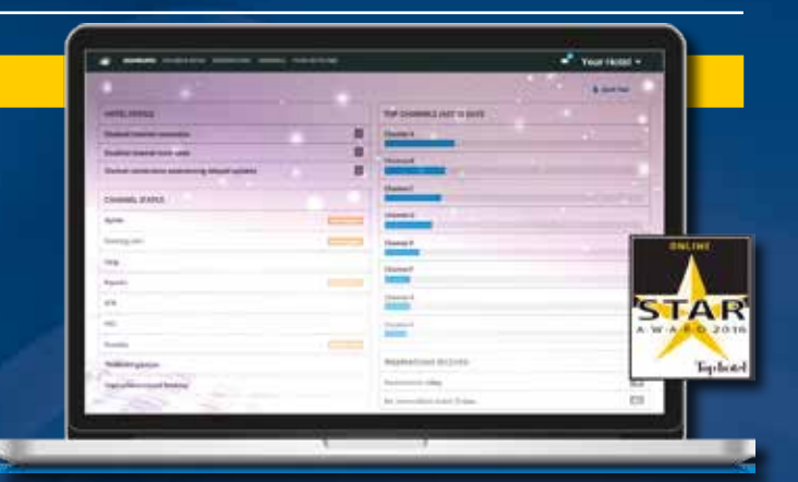
FIND OUT MORE: www.littlehotelier.com

Little Hotelier's solution includes an easy-to-use front desk system, direct booking technology for websites and social media pages and a leading channel manager, powered by SiteMinder. Little Hotelier also offers a responsive, search-friendly, direct-booking website for owner-operators looking to improve their online presence - comprising everything needed to run a successful accommodation business.